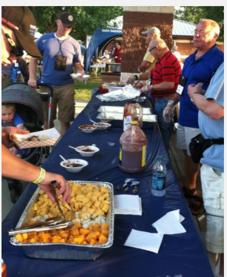
Wisconsin Cheese at States Night food fest.