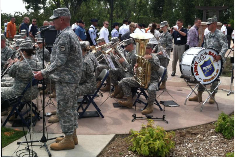
South Dakota Army Band performed for an outdoor welcoming ceremony.